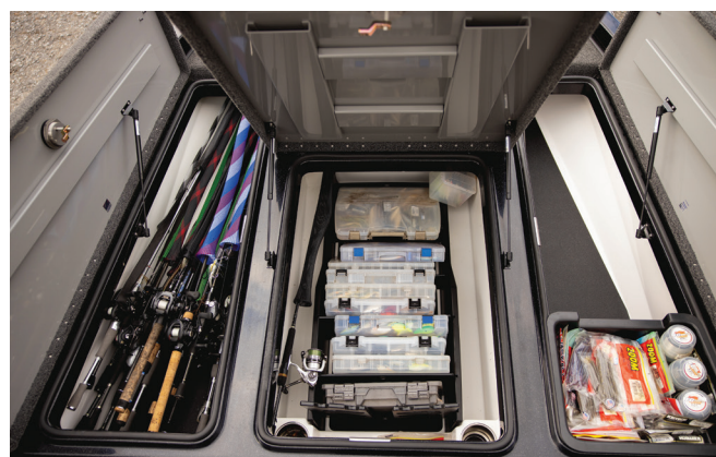
*Pictured boats may have optional equipment